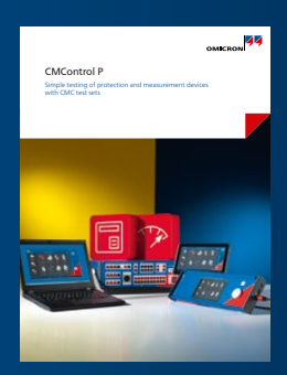
Product catalog (secondary equipment)